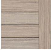
FRENCH WHITE OAK®

For a look that resembles popular hardwoods like White oak and walnut, choose the Landmark Collection. Featuring a crosscut cathedral grain with a matte finish and cascading color blending, this collection is perfect for clients looking for a character-rich style.